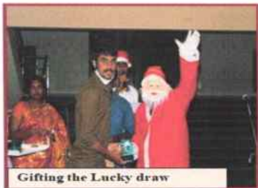
Gifting the Lucky draw