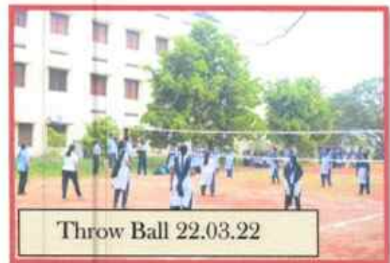
Throw Ball 22.03.22