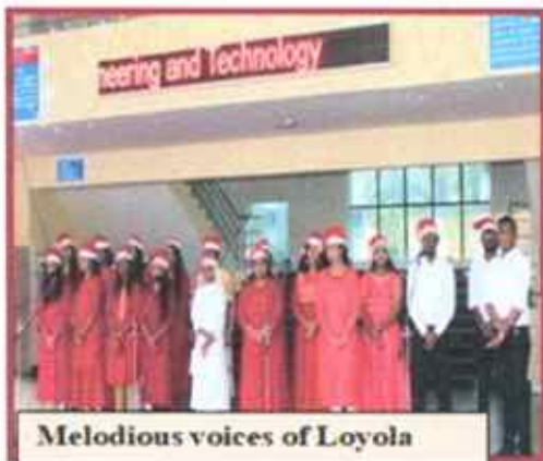
Melodious voices of Loyola