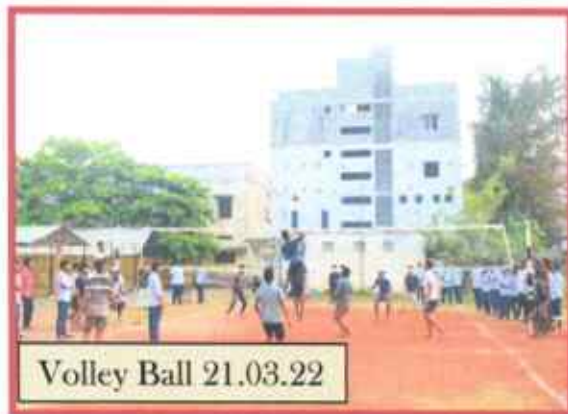
Volley Ball 21.03.22