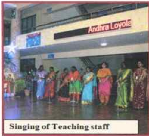
Singing of Teaching staff

An ISO 9001 : 2015 Certified Institution