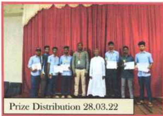
Prize Distribution 28.03.22

An ISO 9001 : 2015 Certified Institution