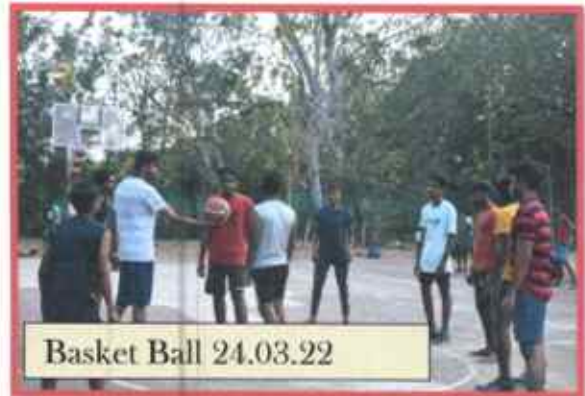
Basket Ball 24.03.22