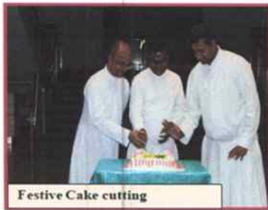
Festive Cake cutting