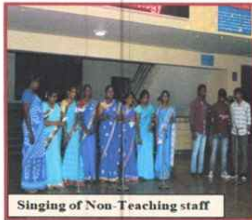
Singing of Non-Teaching staff