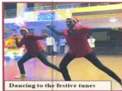
Dancing to the festive tunes

Lm PRINCIPAL ANDHRA LOYOLA INSTITUTE OF ENGINEERING & TECHNOLOGY VIJAYAWADA-520 002