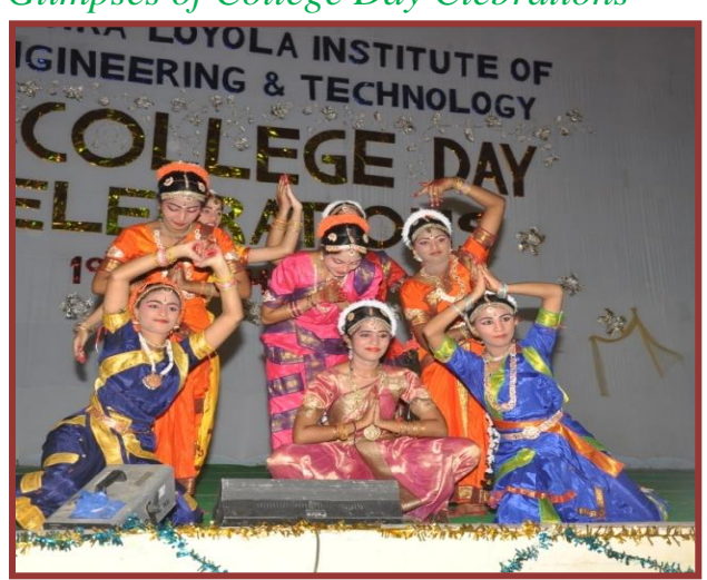
Glimpses of College Day Clebrations

ALIET organizes college day celebrations every year to acknowledge the academic performance of the students. The principal of the college presents the annual report of various achievements of the students and the staff. The initatives taken by the institute are notified to the students and parents. Eminent personalities from various strata of the Society are invited to inspire the future technocrats with life changing messages. Students are given an opportunity to stage to variety of culutural programmes that showcase social responsibility and national integrity. The students achievers in academics, co curricular and extra curricula activites are awarded with ceritficates and mementos.